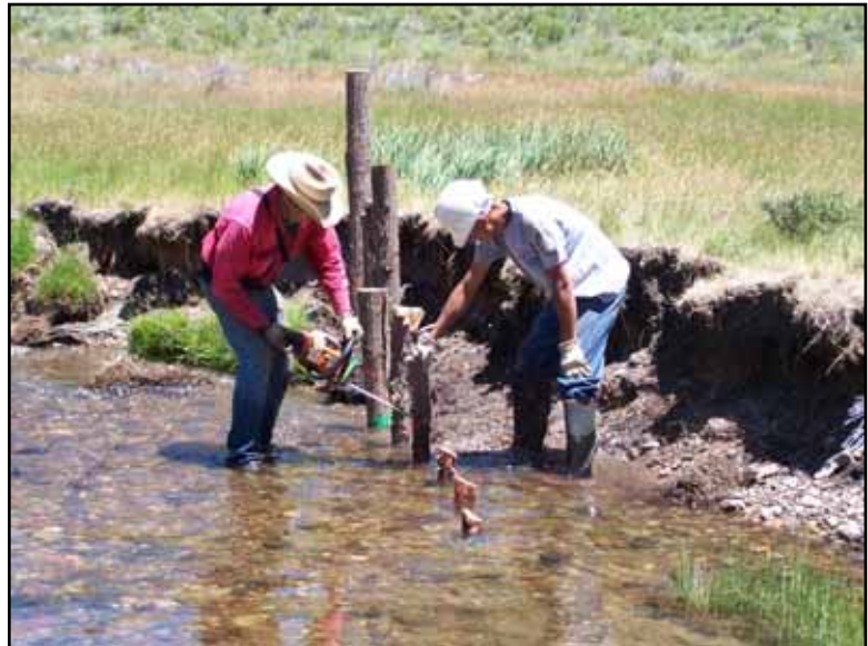
A vane being trimmed to the correct height, Comanche Creek, July 2005

To size a vane at a 30° angle to the bank, place a mark on the bank at the planned bankfull apex of the meander and measure out to not more than mid-channel. This is the width of the vane. Multiply the width by 2 and measure downstream from the first mark. The second mark will be the base of the vane. To be sure that the angle does not exceed 30° (depending on channel characteristics), multiply the width by 3, and install the base of the vane at that point.