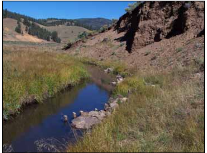
Three post vanes installed along an eroding bank of Comanche Creek, ion 2003

Vanes are structures that deflect streamflow toward the opposite bank. As flows are deflected, energies are concentrated and the concentrated force is focused at the base of the opposite bank causing it to erode, collapse, and recede. As the bank recedes, the channel widens, the thalweg deepens and shifts toward the receding bank, bed materials are flushed away, and a pool forms at the base of the bank.