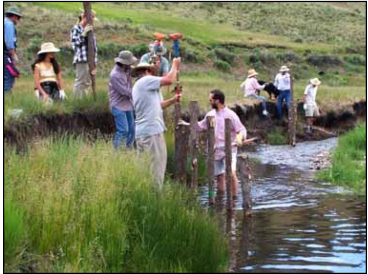
Volunteers install vanes along a bank of Comanche Creek, July 2005

To promote sediment deposition on the evolving point bar, the lengths of posts for both vanes and baffles should taper gradually downward from the planned bankfull elevation toward the bed at mid-channel. Taller structures generate turbulence which tends to flush away point bar deposits so the tops of the deflectors should not be higher than planned bankfull elevation.